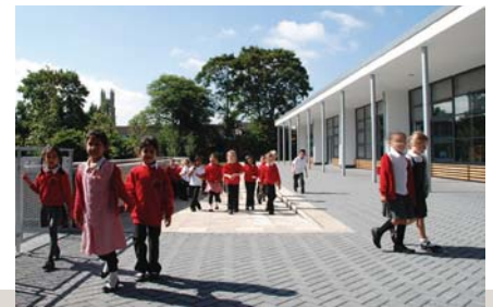
St George's School, Kidderminster - in addition to permeable paving, concrete flags, kerbs and edging have been used for carefully detailed SuDS conveyance, dispersing water and maintaining low flows, such as standard 'bull-nose' concrete kerbs allowing runoff to trickle onto grassed swales.