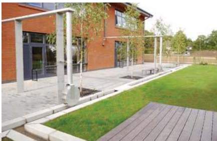
Bewdley School, Worcestershire – standard precast concrete units form rills handling rainwater from conventional concrete block paving and roofs – some via animated water features.

“For too long, we have been designing water out of our towns and cities when we should have been designing it in.” – RIBA, 2014.