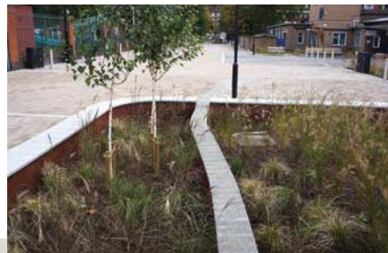
Australia Road, London – concrete block permeable paving laid over an existing road base collects rainwater and gradually discharges it horizontally into planted basins.